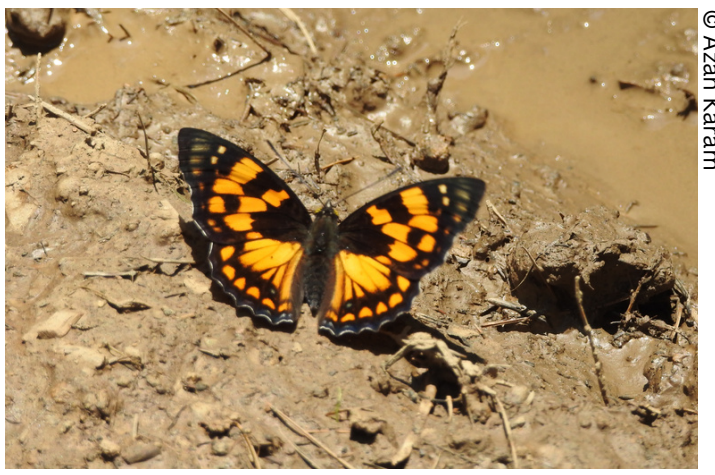
Western Courtier Sephisa dichroa

Kashmir Yellow Wall Kirinia eversmanni cashmirensis were observed almost always clinging to tree barks at considerable height, with occasional descents to shorter vegetation. As the name suggests, Large Silverstripe Argynnis childreni were visibly larger than any species in the area. At least 7 were observed, primarily occupying the sunny, leafy sections of deciduous trees with intermittent dips to mud puddles, shared with Western Courtiers. Fluttering along the sunlit trail were a few Himalayan Sailer Neptis mahendra , approximately five in number, and at least 15 Moore's Fivering Ypthima nikaea puddling in the mud. Nearly invisible on the forest floor due to their exceptional close-wing camouflage resembling dried pine needles on the forest floor from a distance, our disturbance made them retreat to ferns and grasses growing at the sloping edges of the forest - a microhabitat particularly preferred by species in this genera. If at all, they rarely leave forest cover. The most interesting behaviour noted by the authors was of Common Satyr Aulocera swaha . Instead of mud, they preferred mammalian scats (including human faeces) to replenish their nutrient requirements.