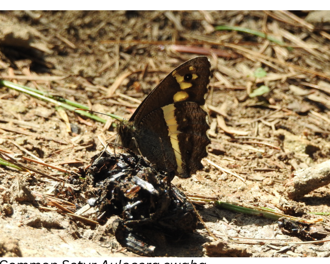
Common Satyr Aulocera swaha