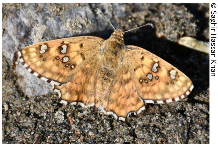
Yellow-spotted Angle Caprona alida