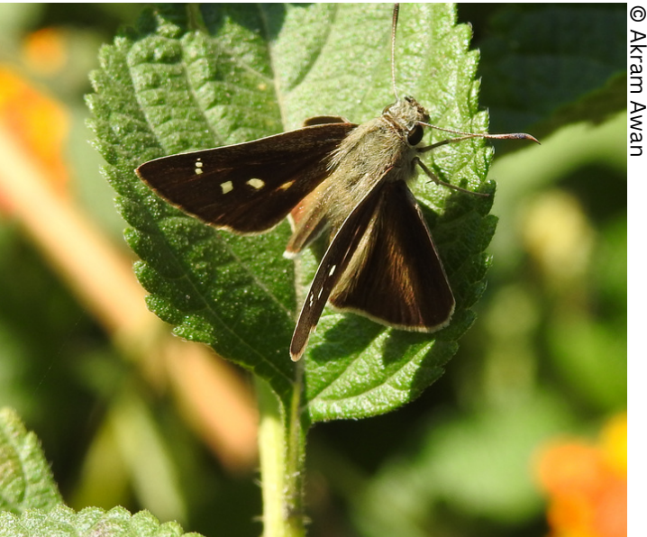
Indian Palm Bob Suastus gremius