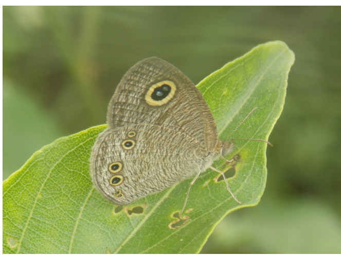
Jewel Fivering Ypthima avanta