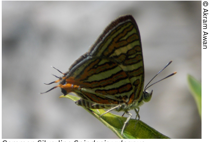
Common Silverline Spindasis vulcanus