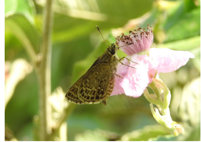
Veined Scrub Hopper Aeromachus stigmatus