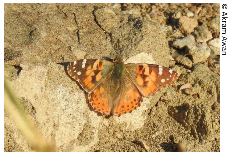
Painted Lady Vanessa cardui