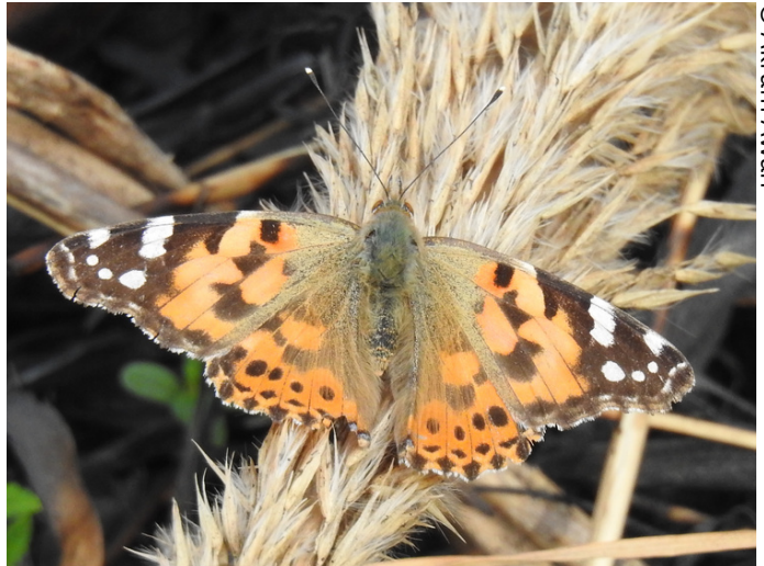
Painted Lady Vanessa cardui