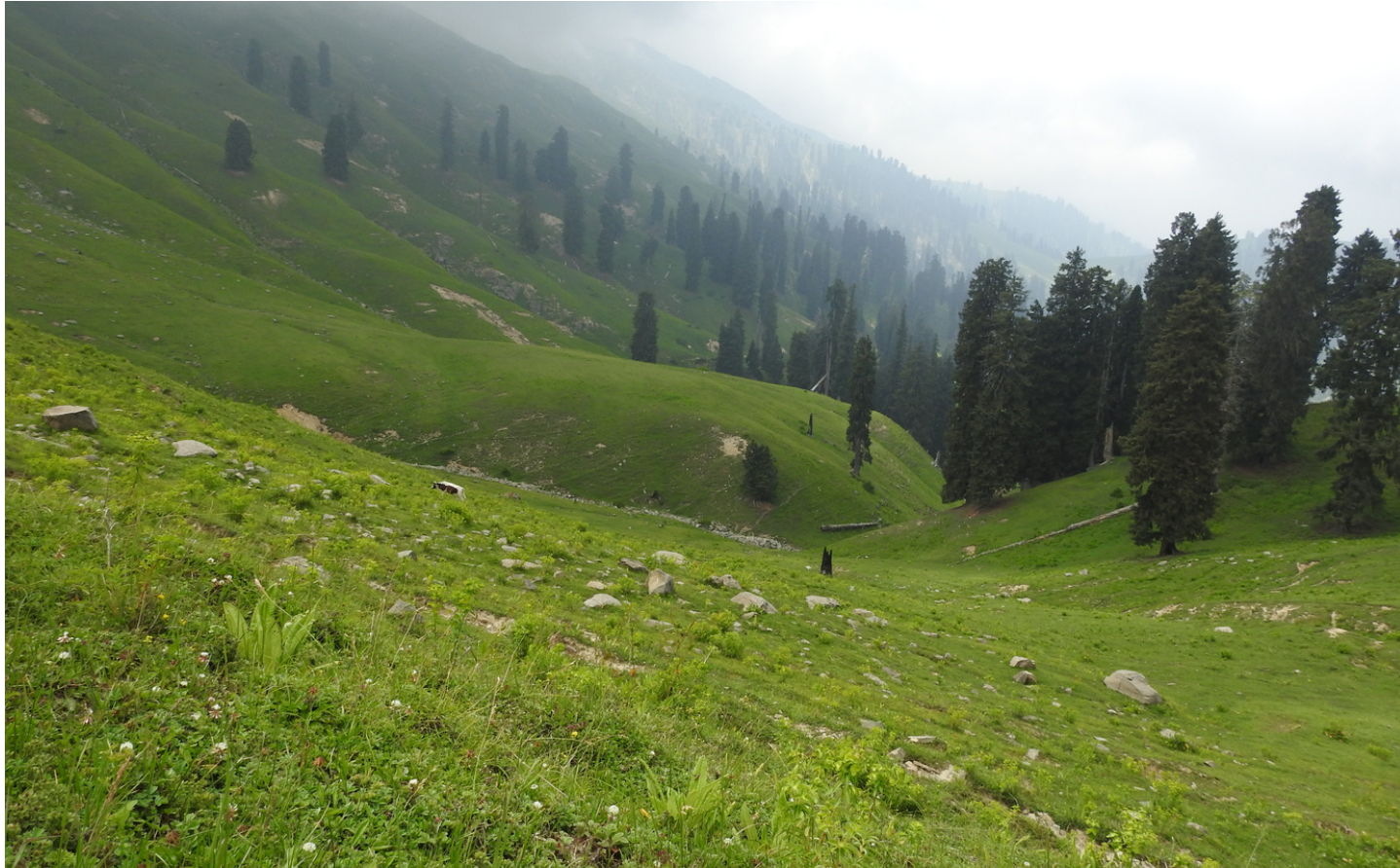
Note the less diversity of plants in more open and higher areas of the meadow system. Palanchai Meadow, Bahrain, Upper Swat.

Meadows are open ecosystems of herbaceous, non-woody plants, such as wild grasses, wildflowers and herbs. They can be natural (also called perpetual meadows) or altered by humans (agricultural meadows or pasturelands) for different purposes, such as livestock grazing areas or hay collection. They are places where wildlife and human communities interact and depend on various ecosystem services, such as pollination, grazing, nesting, display sites for birds, and shelter for subterranean mammals. Butterflies are also an integral ecological component of meadows and forests, where they synchronize their life cycles according to vegetation growth and floral bloom timing. They not only play a major role in pollinating plants but they also provide a protein-rich diet to birds, particularly in breeding season. Most of the natural meadow systems in the uplands of the Hindukush-Himalayan Range have heterogeneous microhabitats where different stages of butterflies (caterpillars and adults) complete their life cycle through niche partitioning. These specialized habitats include open-canopy forests, sunlit forest trails, unaltered forest edges, sunny glades, and open meadows, providing opportunities for each species' life-cycle-dependent requirements.