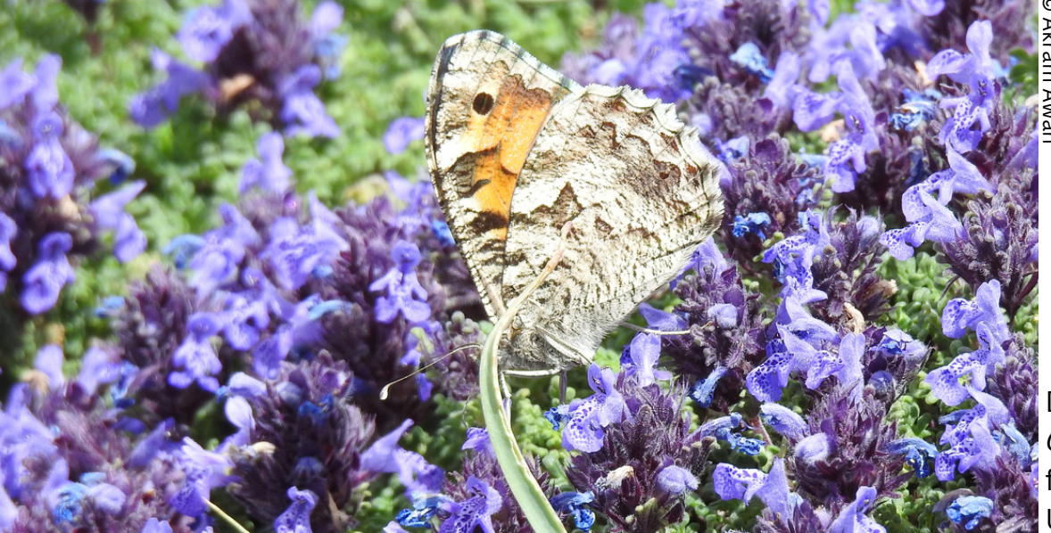
Dark Hermit Chazara enervata from Zani top, Upper Chitral.

BACKGROUND: Lesser Bath White Pontia chloridice by Akram Awan