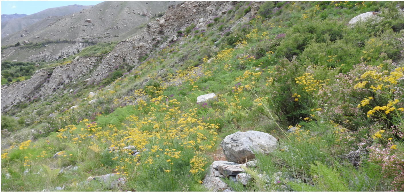
Habitat of Chitral Purple Copper Hyrcanana evansi (Shagrom valley, Upper Chitral, KP)

پاکستان میں تتلیوں کی 13 انواع دنیا کے کسی اور ملک میں نہیں پائی جاتیں۔ ان انواع کو 'اینڈیمک سپیشز' کہا جاتا ہے۔ چترالی جامنی شفق انہی میں سے ایک نوع (یا نسل یا سپیشز) ہے۔ اینڈیمک سپیشز ہمارا قدرتی ورثہ ہیں۔ ہمیں چاہیے کہ ہم انکی قدر کریں اور انکے تحفط کو یقینی بنائیں۔