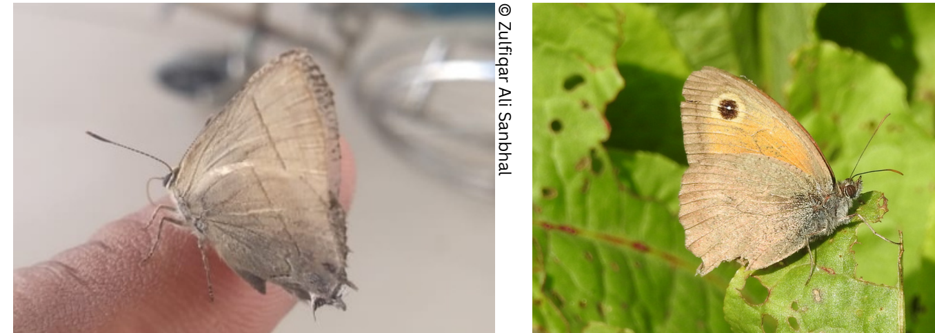
Common Flash Rapala nissa