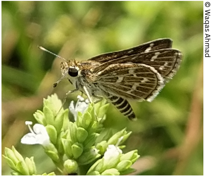
Common Grass DartTaractrocera maevius

Examples: Common Grass Dart Taractrocera maevius , Indian Palm Bob Suastus gremius.