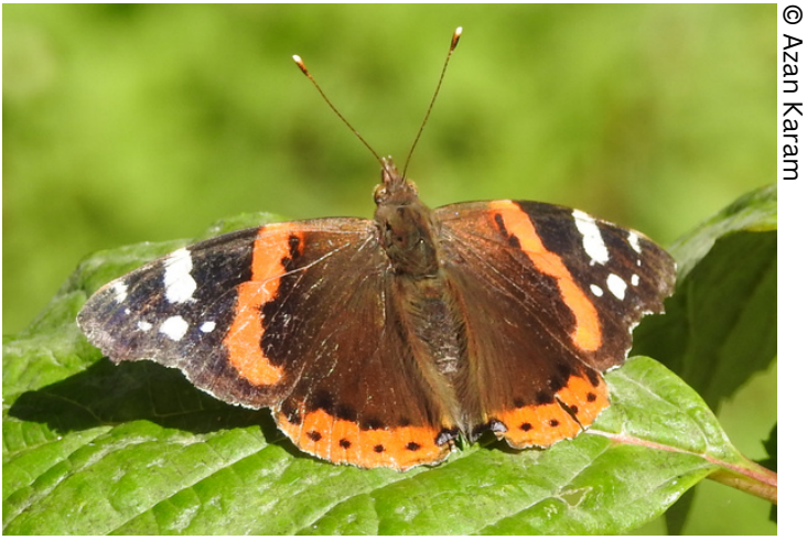
European Red Admiral Vanessa atalanta