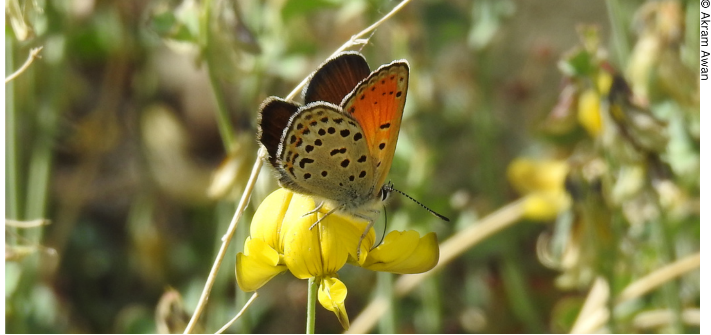
Chitral Purple Copper Hyrcanana evansi

شفق تتلیوں کو یہ اردو نام انکے پنکھوں کے سرخی مائل رنگ کی وجہ سے دیا گیا ہے جو کم و بیش تمام نسلوں میں پایا جاتا ہے۔ پاکستان میں شفقوں کی کل 9 انواع پائی جاتی ہیں۔ انگلش میں انکو "کاپرز" کہا جاتا ہے۔