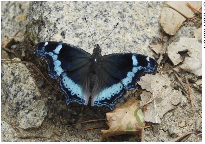
Blue Admiral Kaniska canace