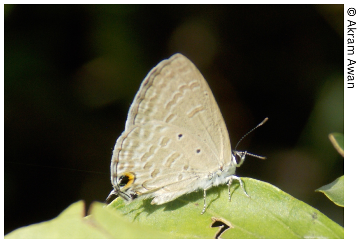
Forget-me-not Catochrysops strabo