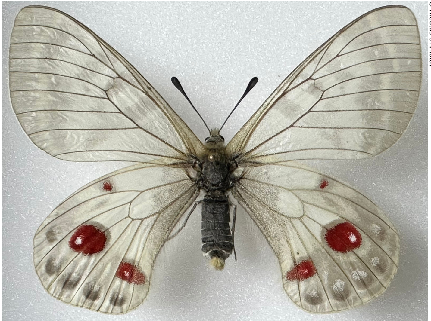
Albino Regal Apollo Parnassius charltonius