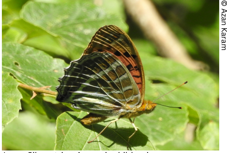
Large Silverstripe Argynnis childreni