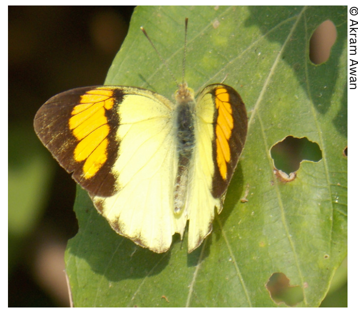
Yellow Orange-Tip Colotis danae

I have been working on the distribution of Pakistani butterflies for over a decade, hailing from Dhadhar village in Soon Sakesar, near Khabeki Lake. My visits to the village, however, have been sporadic, sometimes with gaps of years in between, which has limited my ability to observe butterflies throughout the entire year. The majority of the data came from my own observations (mostly between September-November) in my village and its immediate surroundings, with a few contributions from other villages by some friends. This report contains a list of 38 species observed between October 2014 and February 2024. While this is only a preliminary checklist, I believe the number of species could greatly increase with more focused research conducted year-round across the valley.