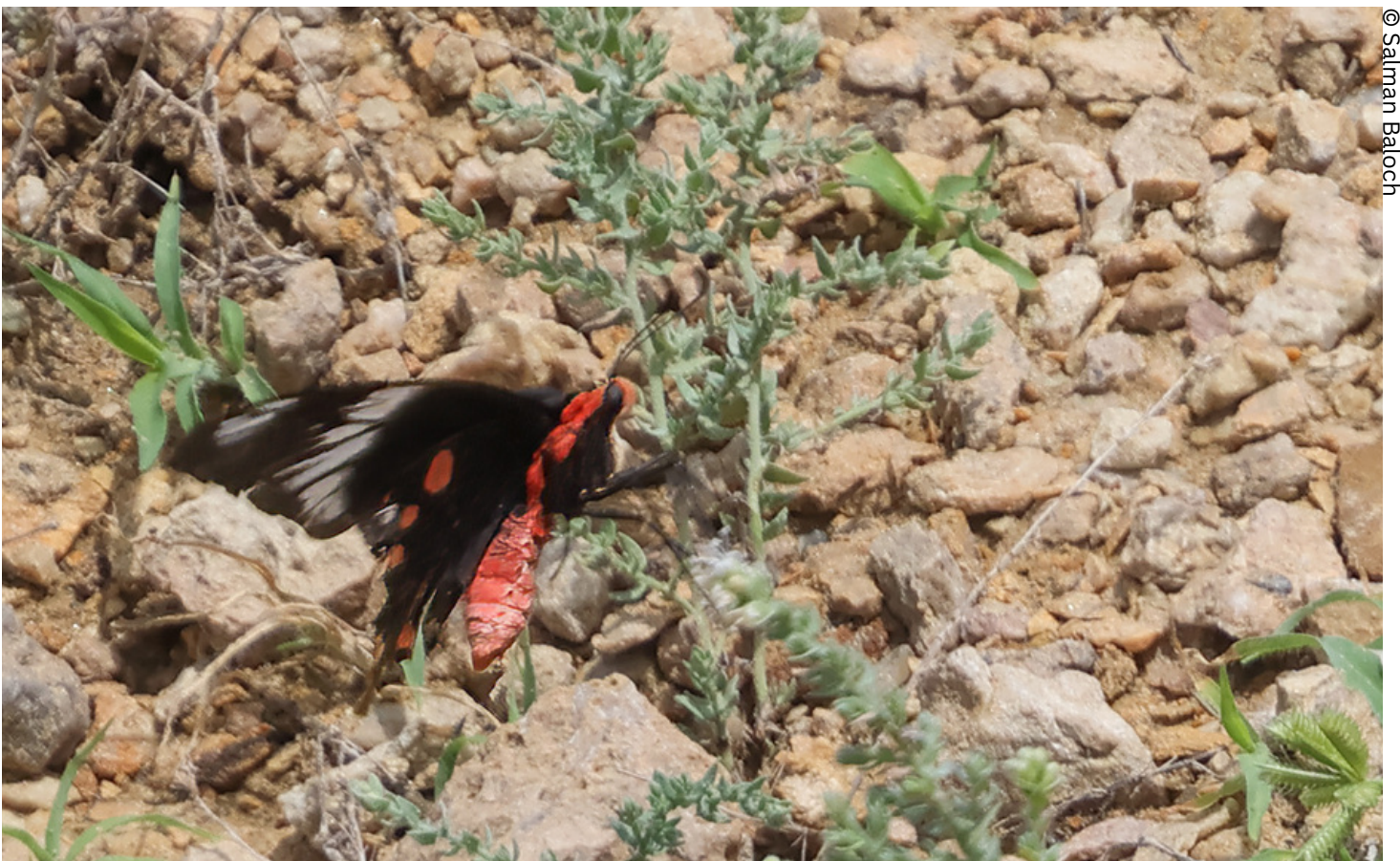
Crimson Rose Pachliopta hector from Manjar Goth, Soneri beach, Karachi.