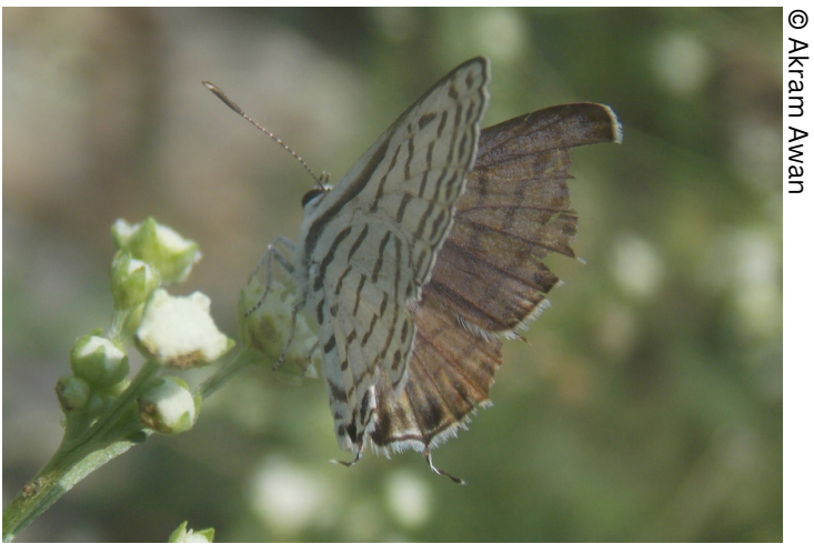
Indian Pierrot Tarucus indica