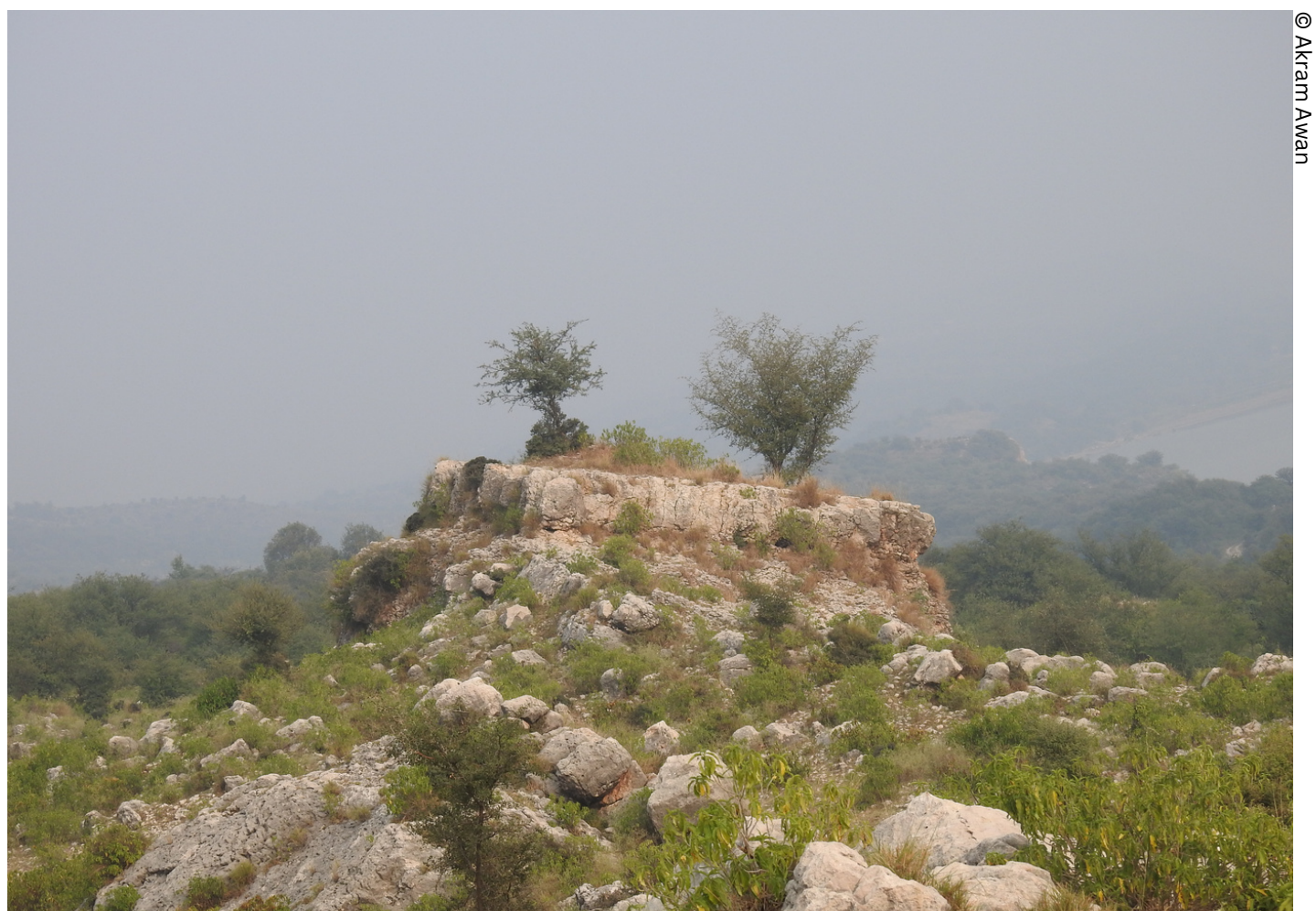
A view of Dhadhar village, near Khabeki lake, Soon-Sakesar valley