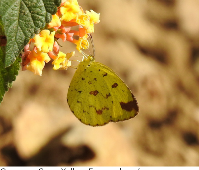
Common Grass Yellow Eurema hecabe