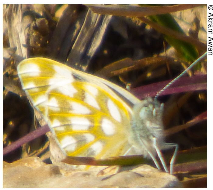
Desert Bath White Pontia glauconome