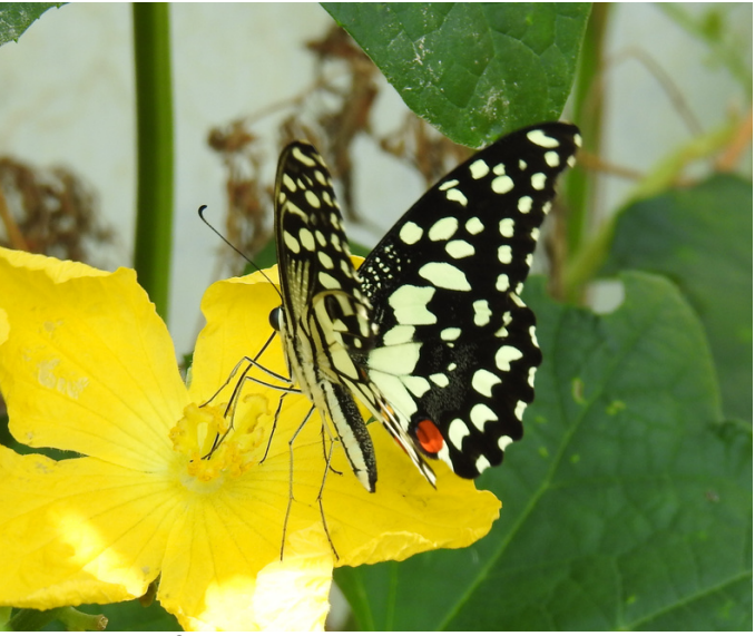
Lime Butterfly Papilio demoleus