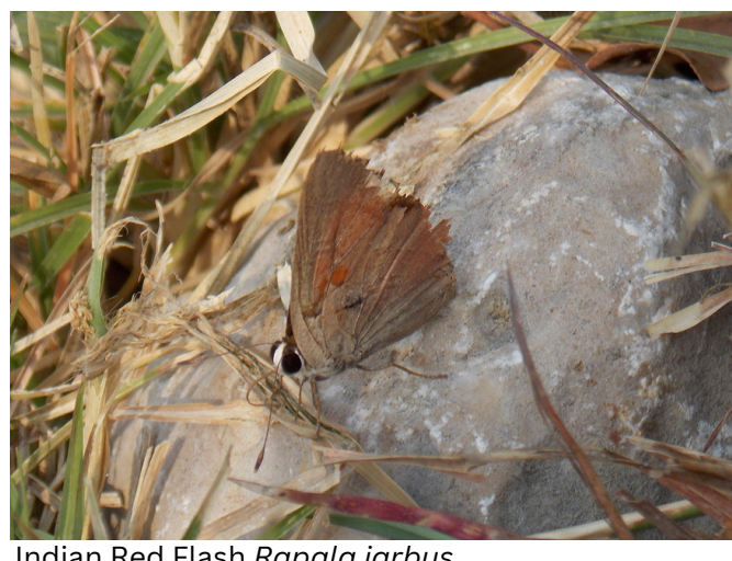
Indian Red Flash Rapala iarbus