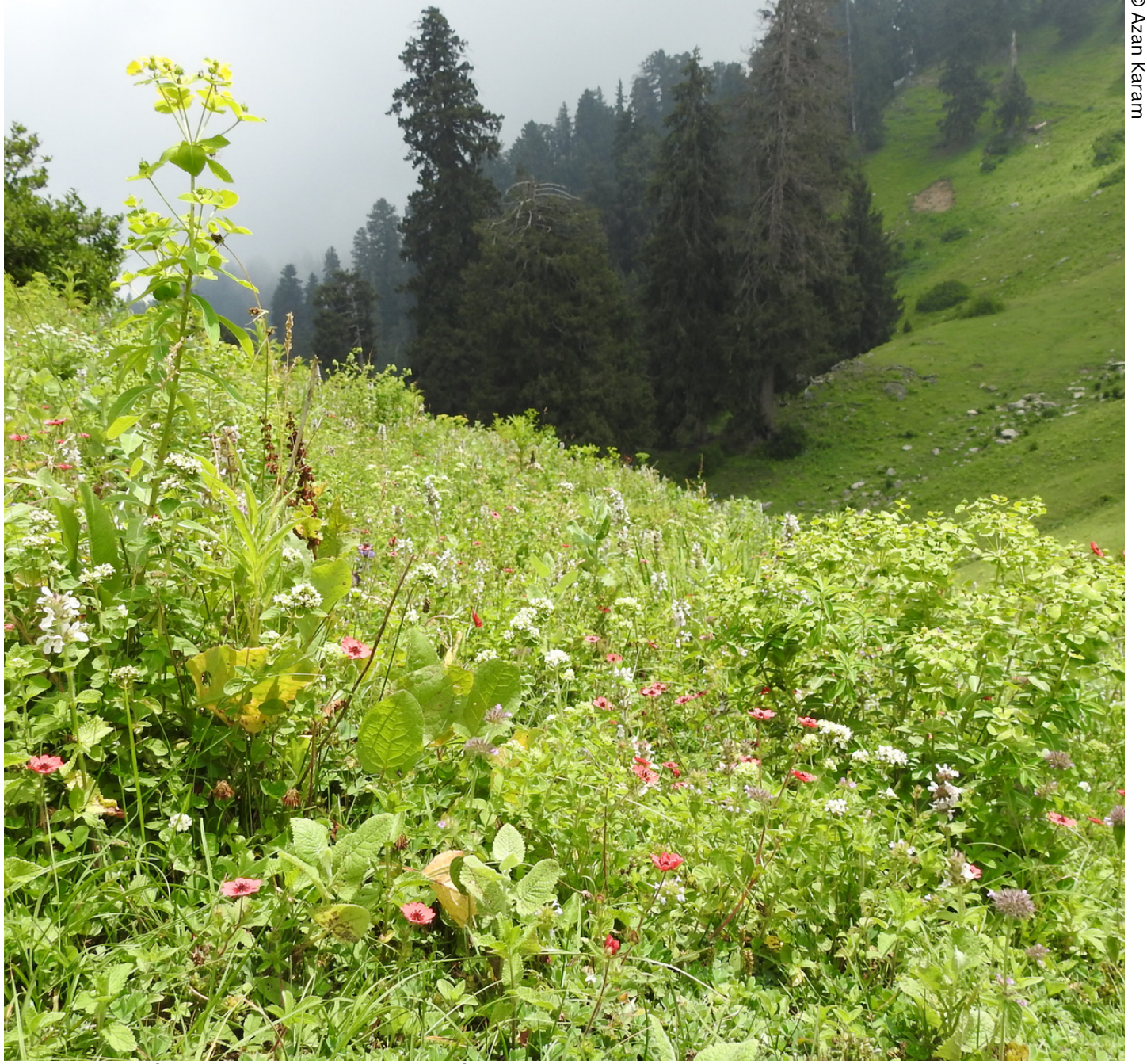
The unaltered forest edge showing a diverse floral community. Palanchai Meadows, Swat

This series continues to Karr, Daral, and concludes at Daral Lake, where it remains unexplored. The dense and abundant wild vegetation that makes up the forest borders creates a small but crucial transition zone between the open meadows and forests. With comparatively higher abundance and maybe greater diversity in both open meadows and forests combined, they are especially interesting for future lepidopteran exploration and diversity studies. Prioritising these transition zones in particular would help us get better insights, as the meadow systems of the Swat Valley are relatively understudied in biodiversity research. The authors also recommend that long-term comparative studies of lepidopteran diversity be conducted on the borders of oak and coniferous forests, both natural and modified, as they transition into open meadows.