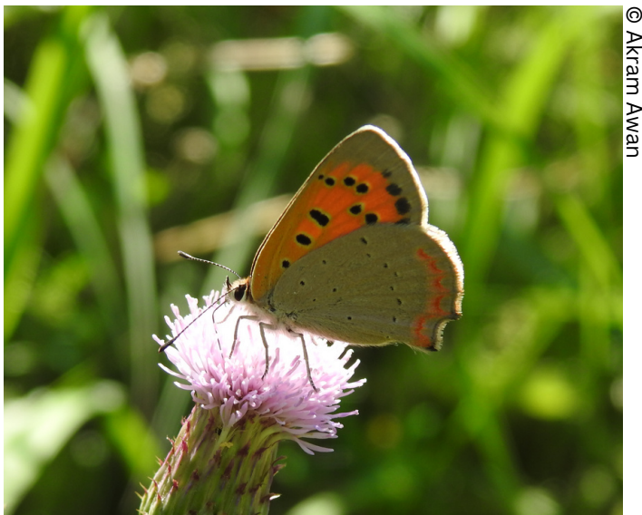
Common Copper Lycaena phlaeas