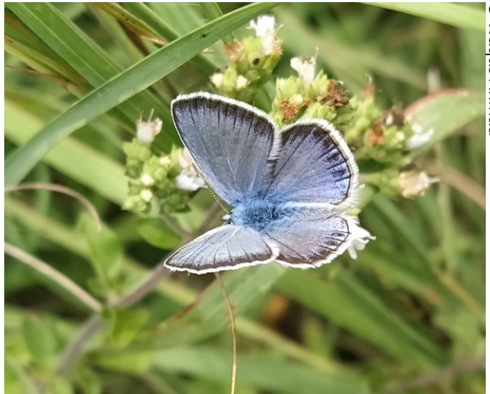
Kashmir Meadow Blue Polyommatus pseuderos