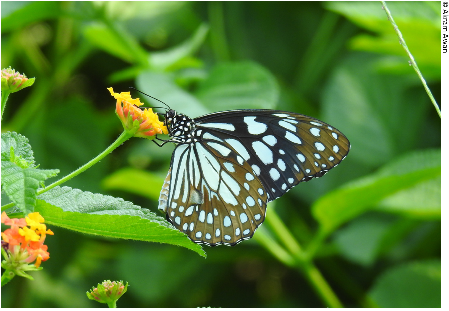
Blue Tiger Tirumala limniace