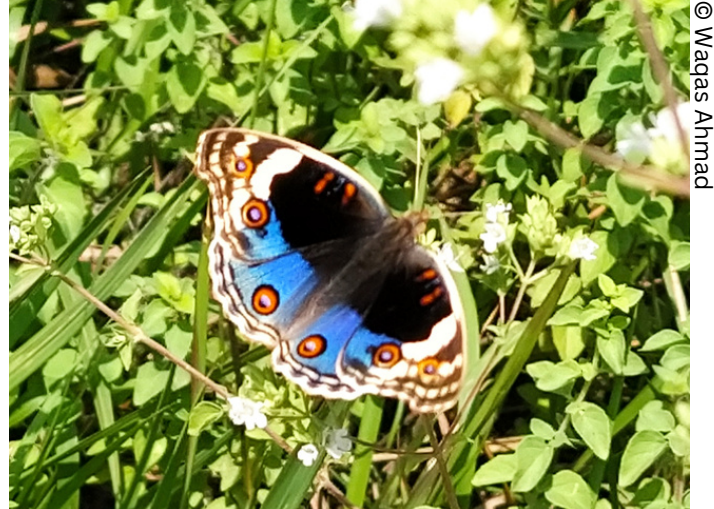
Blue Pansy Junonia orithya

Examples: Blue Pansy Junonia orithya , Painted Lady Vanessa cardui and Blue Tiger Tirumala limniace .