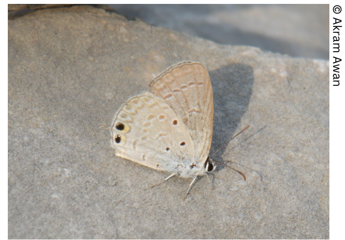
Gram Blue Euchrysops cnejus