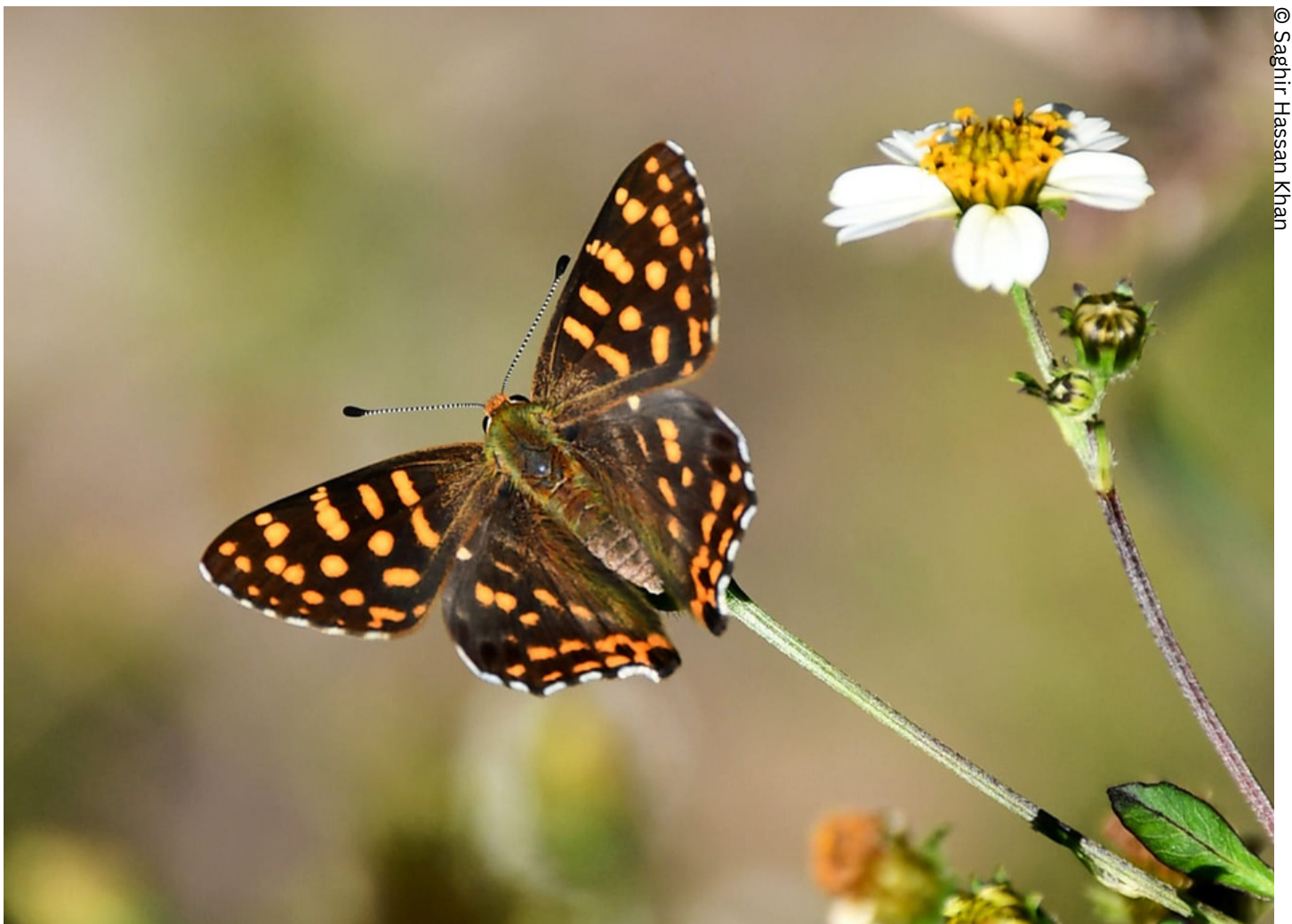
Common Punch Dodona durga