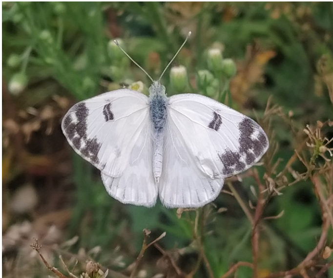
Himalayan Bath White Pontia endusa moorei

Structure: All 6 legs fully-functional. Abdomen is hidden by wings when they perch. Appearance: Generally, they have white, yellow, or orange wings with black markings. Examples: Himalayan Bath White Pontia endusa moorei and Common Grass Yellow Eurema hecabe.